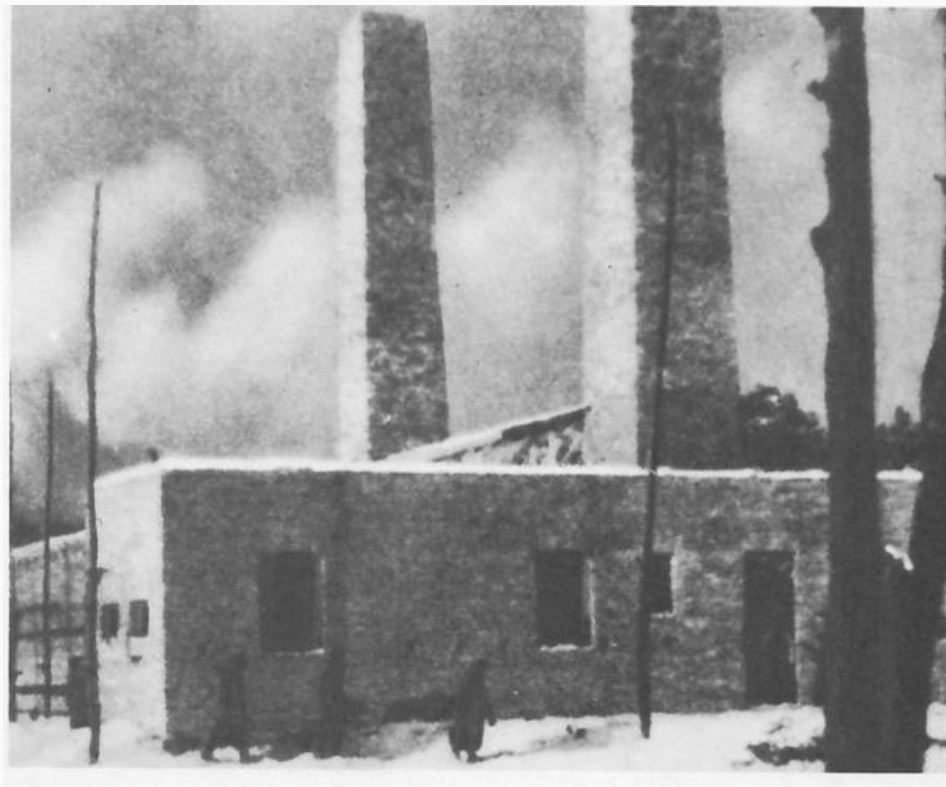
Krematorium IV burning in the Sonderkommando revolt of 1944

We revolted at every camp, including, most famously, at Auschwitz Birkenau, where In the Sonderkommando revolt of 1944, we attacked SS guards with smuggled weapons, blew up one of the four crematoriums, reducing the killing capacity of Auschwitz Birkenau by a quarter, and saving hundreds of thousands of lives, and also threw a particularly sadistic SS Guard into the ovens to burn alive at another.