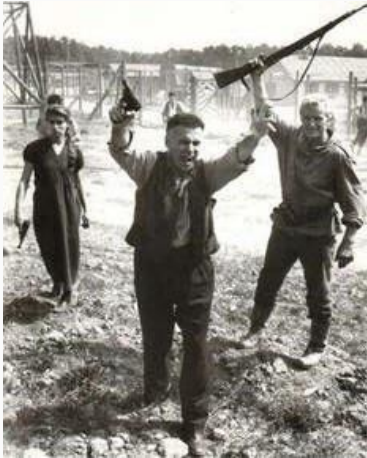
Antifa at Sobibor

When the survivors of Treblinka were sent to the death camp at Sobibor, they gave it the same treatment.