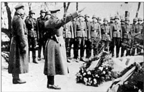
MILITARY FUNERAL FOR THE NAZIS KILLED IN THE SOBIBOR REVOLT Chełm, Poland, October 17, 1943